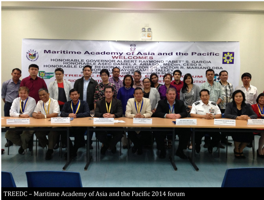
TREEDC – Maritime Academy of Asia and the Pacific 2014 forum

Philippine community and university leaders will converge to TREEDC Members Tennessee Tech University and the City Cookeville for the TREEDC Inaugural Renewable Energy Conference from October 12 to 14. The delegates will also tour various TREEDC businesses and projects from all over the state. The objectives of this visit are to generate continued good will and advance further outreach and business development opportunities for the Philippines and Tennessee.