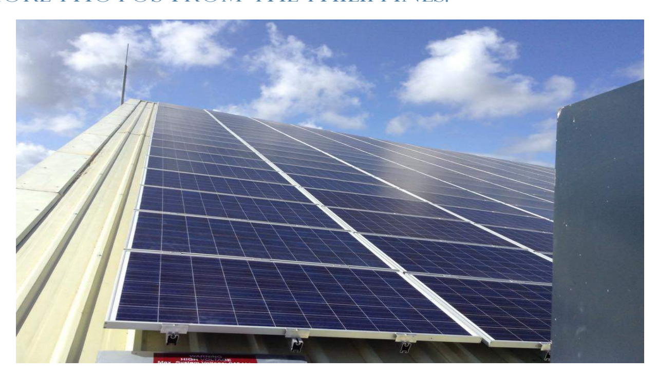
Puerto Princesa 78 kw Solar Rooftop