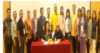
The MoU Signing between PAEPI President and Rector of STIE Perbanas Surabaya (sitdown)