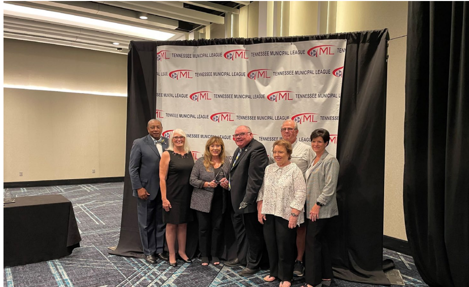
Paris Tennessee Mayor, City Manager and Board of Commissioners receive award.

Congratulations to TREEDC Member City of Paris for being awarded a statewide award in Green Leadership by the Tennessee Municipal League. The City of Paris recently implemented significant modifications for programmable thermostats, movement sensors for lights, LED lighting in buildings and updated HVAC systems.